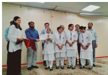
Glimpses of Prize Distribution function on 78 th Independence Day