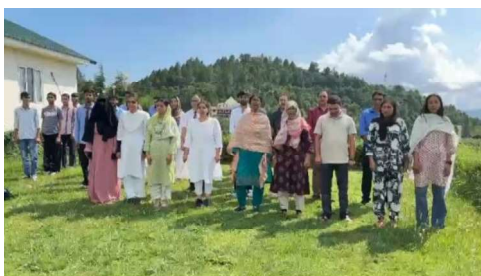
Department of Management Studies

Team of students from College of Nursing received the 1 st position. Department of Mathematics got the 2 nd position and Department of Management got 3 rd position.