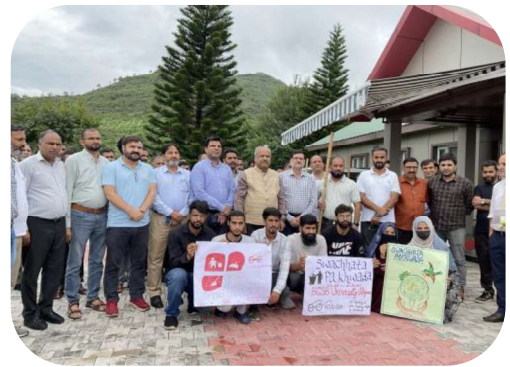
Swachhata Pakhwada at BGSBU