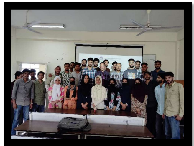
Entrepreneurs' Day Celebration at the Department of Civil Engineering, BGSB University