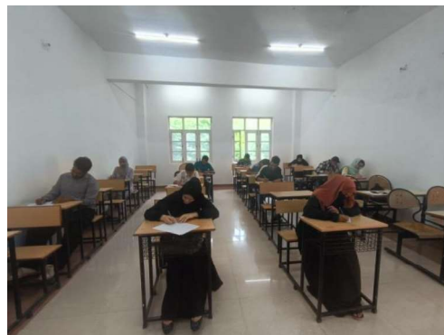
Participants from various departments in essay writing competition

In Essay writing completion organized by the Office of the Dean of Students on the topic "Indian Freedom Struggle".