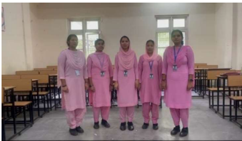
College of Nursing

Participants from various departments of the University Posing with their drawings/paintings