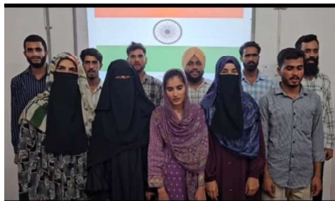
Department of Mathematics

In National Anthem Singing organized by the office of the Dean of Students.