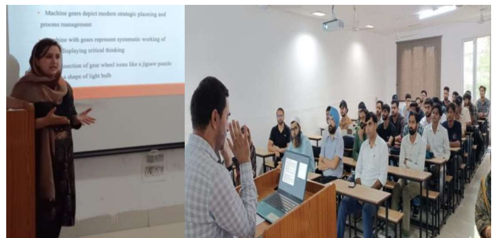
Entrepreneurs' Day Celebration at the Department of Electrical Engineering, BGSB University